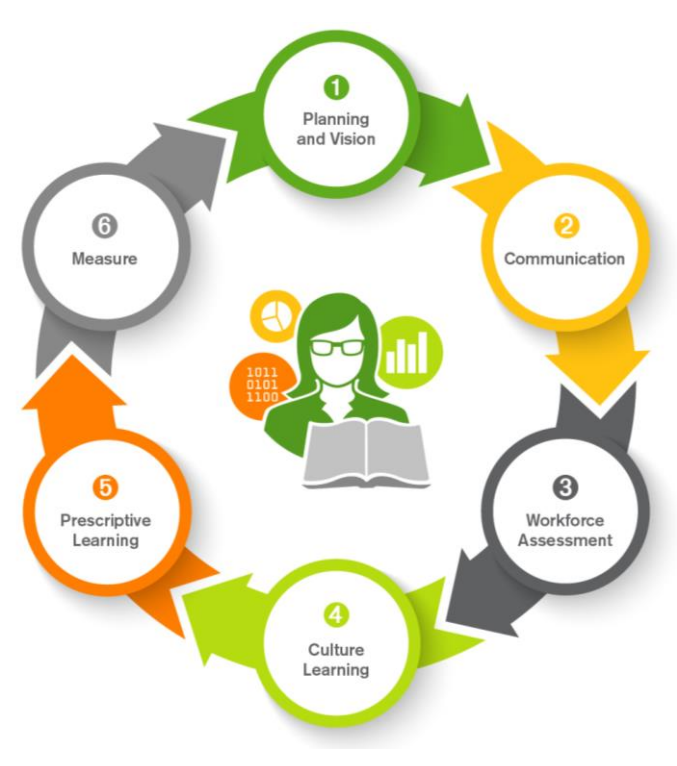
Figure 1. Steps in building a data literacy program

Note: an organization's data literacy program and plan will be implemented alongside an organizations data and governance strategies, and should help those plans to succeed.