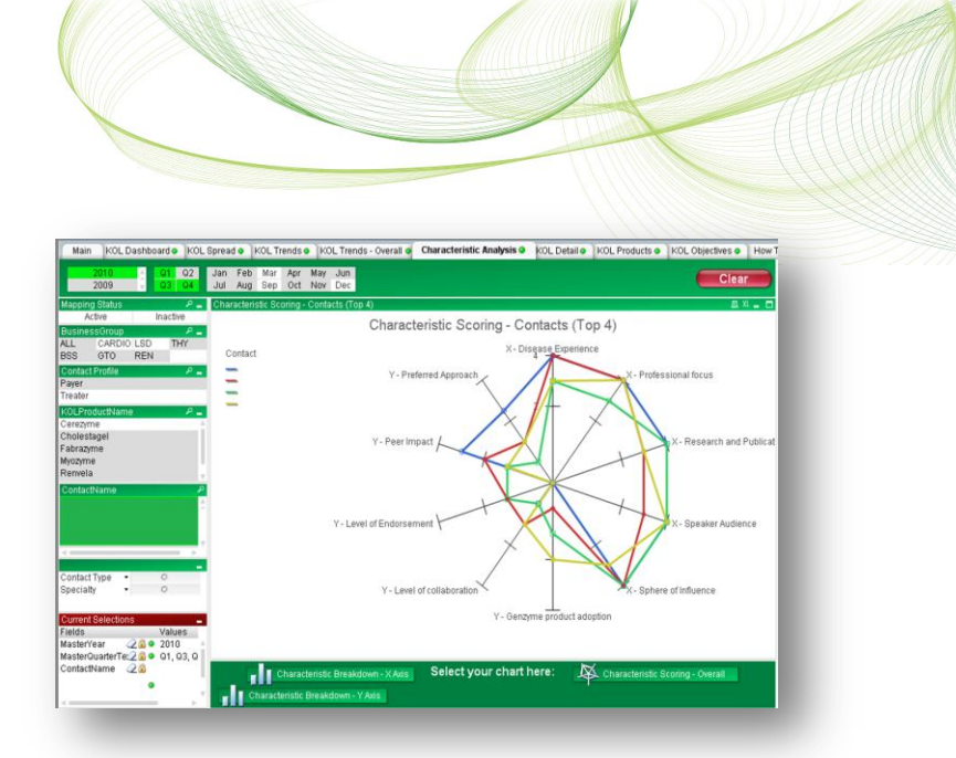
The KOL Mapping app analyses different characteristics to determine development areas for each KOL.

Although compliance reporting has always been high, it was not measured before QlikView. Now, using a QlikView application that automates adverse event report monitoring, follow up reports have vastly improved. Genzyme employees can use the application to better manage their workloads, as well as maintain compliance with the company's standard operating procedures for adverse event follow up. The QlikView application also allows Genzyme to glean more precise information about adverse events, such as monitoring the number of events reported against individual products, and whether they are in clinical trials. The application also shows which hospitals or healthcare providers have reported adverse events.