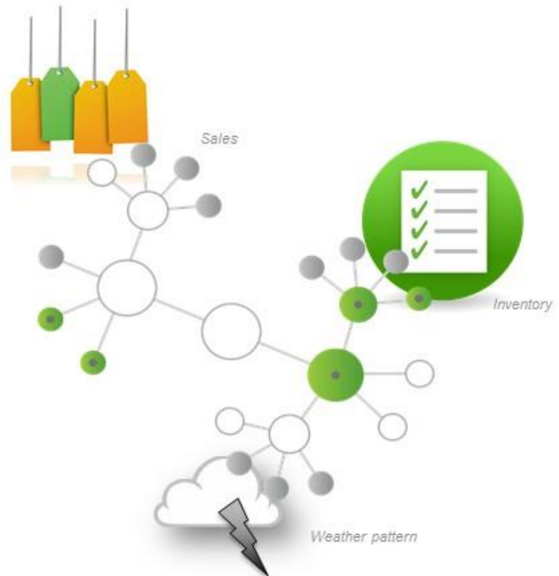
Reveals relationships in multi-source data sets

The world is changing at an ever increasing pace and organizations needs to stay ahead of their competition by becoming more agile and to able to respond to external changes. Innovation is the key to keep up with the pace of market change. In order to do this, businesses should adopt an outside-in data view approach when analyzing business operability and performance.