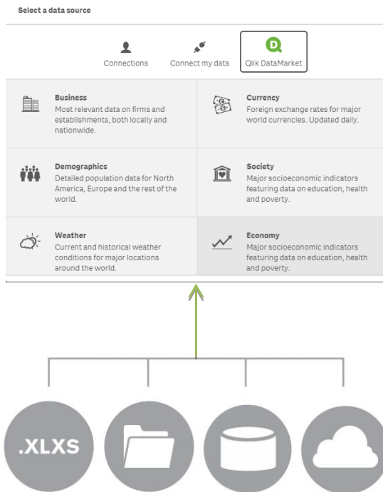
Seamless experience of ingesting data

Being able to access and combine data is a crucial first step to gaining insight and value from the data. Acquiring data from external sources shouldn't be more difficult than loading from internal sources, and users of any skill level should be able to easily associate external data with their internal data.