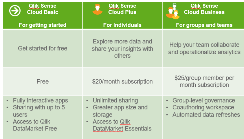
Current Qlik Sense Cloud Offerings

Qlik Sense Cloud includes free (Qlik Sense Cloud Basic) and paid subscriptions (Qlik Sense Cloud Plus and Cloud Business). Each offering can aid you in your journey to quicker, smarter decisions.