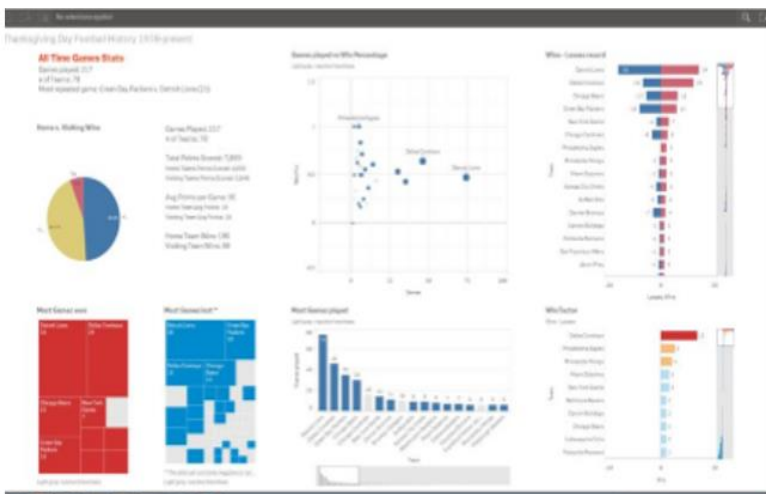
Create, edit and share fully interactive Qlik Sense apps and visualization

Flexible sharing and collaboration features ensure you can collect and share knowledge across your distributed network. Qlik Sense Cloud allows public and private app sharing with anyone, anywhere, on any device.